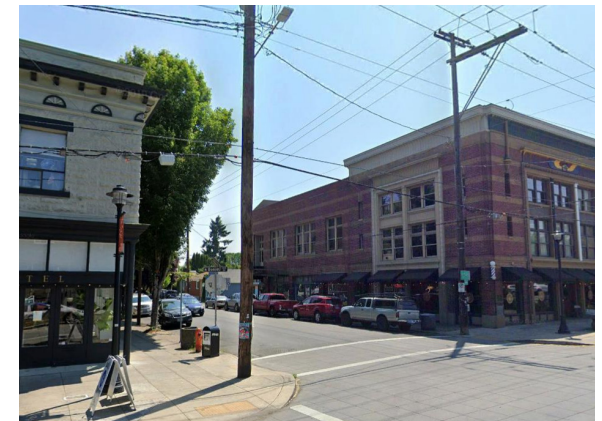
N Denver Main Street