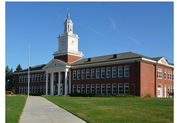
Roosevelt High School