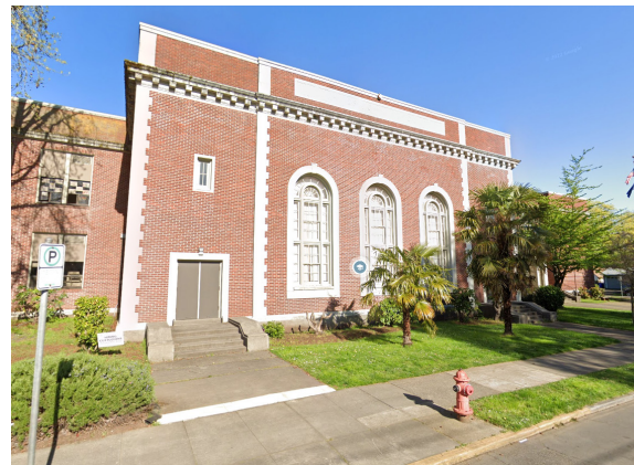
James John Elementary