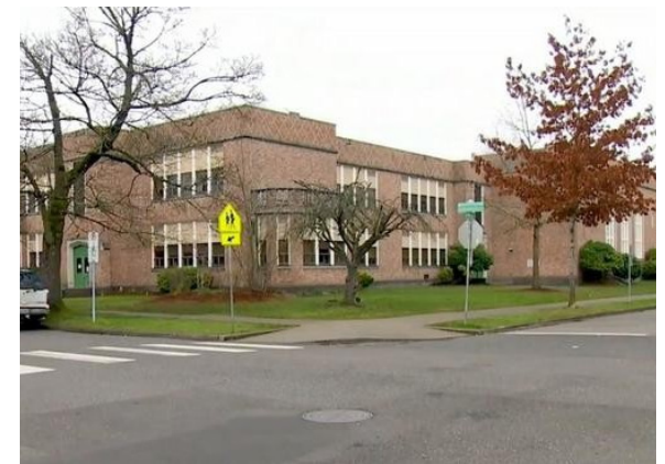
Ockley Green Middle School