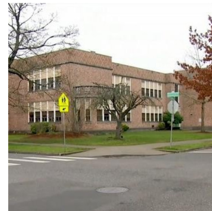
Ockley Green Middle School