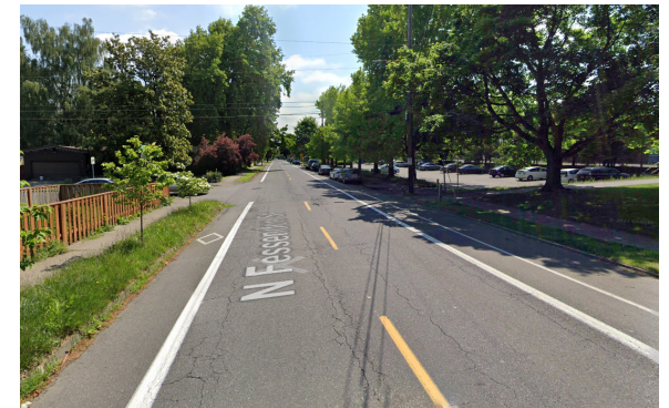
N Fessenden St Near Northgate Park