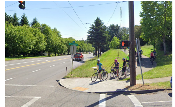
N Columbia Blvd Multi-Use Path