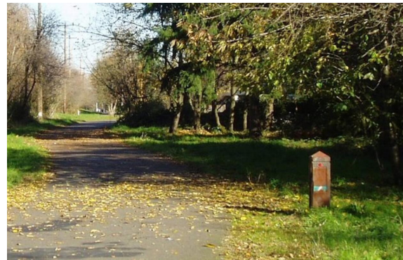
Peninsula Crossing Trail