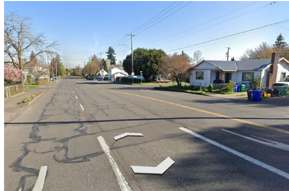
N Macrum Today

The width of the street, combined with low volumes of traffic presents a rare opportunity to reconfigure the layout of the street to add on-street parking, street trees, and high-quality buffered bike lanes connecting to bike routes on N Fessenden St and N Columbia Way. All of these improvements can be realized while still maintaining a travel lane in each direction and a center-turn lane. Additionally, this project would add a new crossing where N Macrum crossing N Columbia Way and include safety improvements at the intersections at N Columbia Blvd and N Columbia Way.