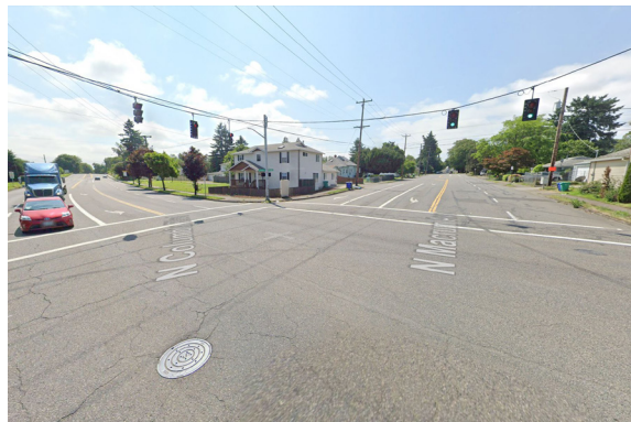
N Macrum and N Columbia Blvd