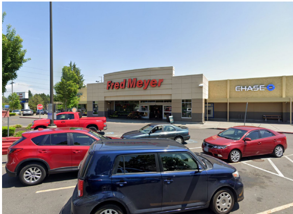
Fred Meyer on N Ida

This project would fill in missing sidewalks and add more frequent pedestrian crossings to provide safer access for people walking. The project would also widen and improve the existing bike lanes to create a better connection between the existing bike lanes on N Willamette Blvd and the N Central Neighborhood Greenway. Additional project elements could include increasing tree canopy, street lighting, and other streetscape improvements.