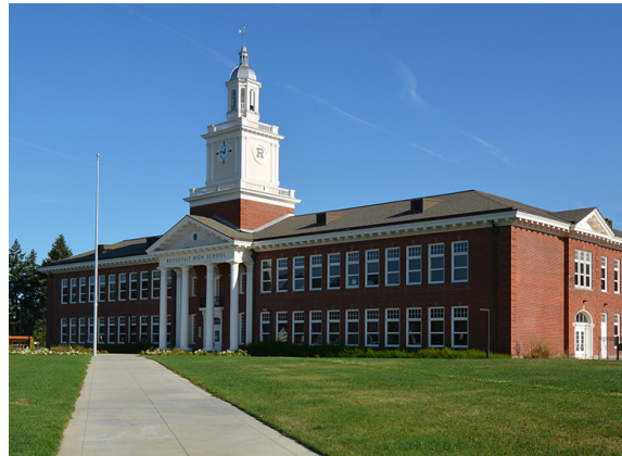
Roosevelt High School