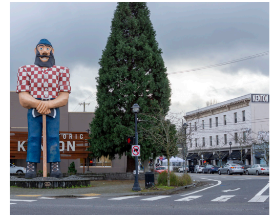
N Denver Main Street